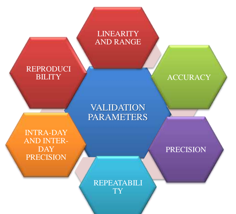
Fig. 2. VALIDATION PARAMETERS

The ability of an analytical method to produce test results that are directly proportional to the concentration of analyte in sample within a certain range is referred to as linearity. The range of an analytical method is the range of analytes that have been proved to be determined within a reasonable level of precision, accuracy, and linearity. Dilutions of 5 - 30 µg/ml OFL were made, and absorbance was measured at 302 and 289 nm for each dilution. The degree of agreement among individual test results when the method is applied repeatedly to several samplings of homogeneous samples is defined as an analytical method's precision. It was expressed as a coefficient of variation and provides an indication of random error results (CV). In each case, the correlation coefficient was calculated. Accuracy is the proximity of the method's test results to the true value. To test the precision, 20 pills were weighed and powdered before being analyzed. Recovery studies were conducted by adding standard drug to the sample at three different concentration levels, namely 80%, 100%, and 120% of the actual amount, while taking into account the percentage